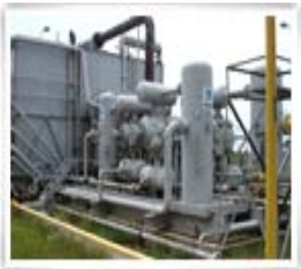
Air & Gas Compression