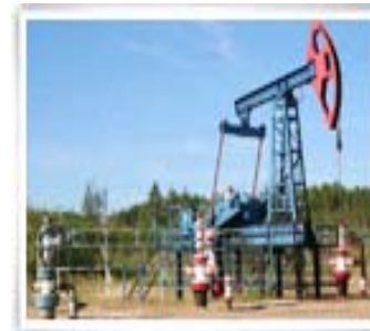
Oil & Gas Exploration