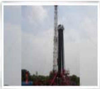
Workover and Drilling Rigs