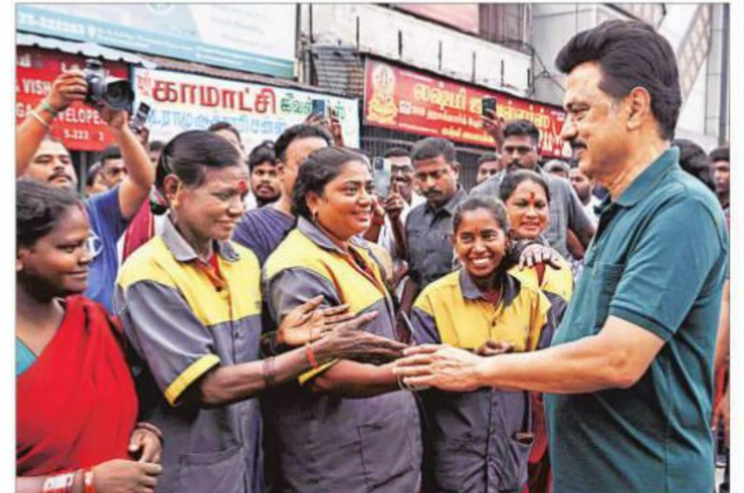
Tamil Nadu Chief Minister and DMK candidate from Kolathur constituency, MK Stalin, interacts with women workers during a voter outreach, in Tiruvannamalai on Wednesday

West Bengal goes for polls in two phases on April 23 and 29. The poll panel deploys general, expenditure and police observers in poll-bound states to work as its eyes and ears. They report to the poll authority about different aspects from the ground to help it take corrective steps. —PTI