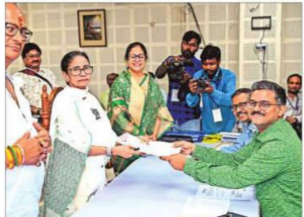
West Bengal Chief Minister and TMC candidate from the Bhabanipur constituency, Mamata Banerjee, files her nomination on Wednesday

Her Wednesday remarks at rallies in Hooghly district's Arambagh, Balagarh and Sreerampore came a day after Election Commission data showed nearly 9.1 million voters have been deleted from the electoral rolls in West Bengal from the original voter base of 76.6 million in October 2025 following the SIR exercise. "You will not be able to defeat the TMC by deleting