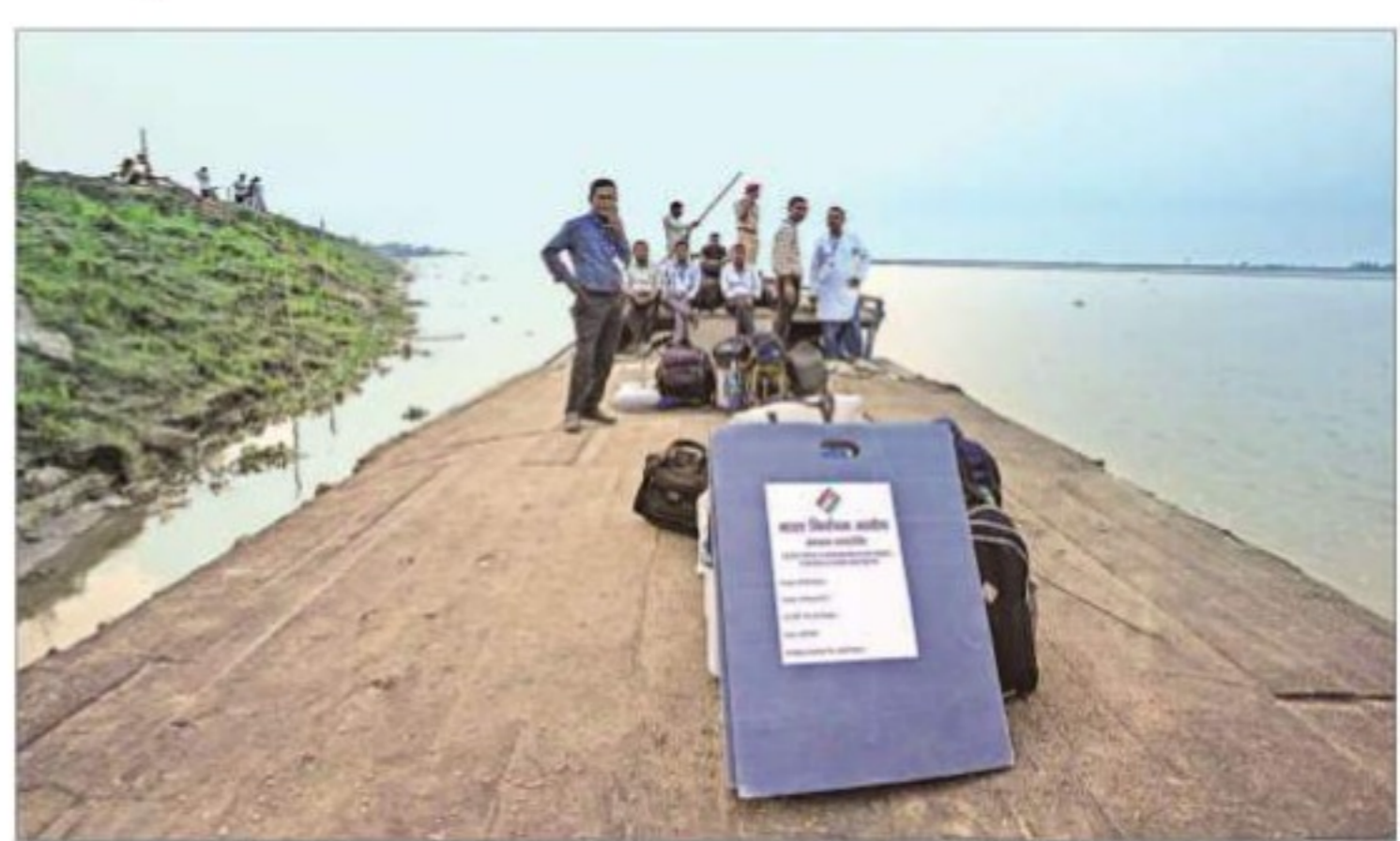
Polling officials board a boat to reach their respective booths, in Kamrup, Assam, on Wednesday

Chief Minister Himanta Biswa Sarma has spearheaded the BJP's campaign across the state, with the party contesting