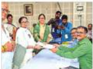
West Bengal Chief Minister and TMC candidate from the Bhabanipur constituency, Mamata Banerjee, files her nomination on Wednesday.

"You will not be able to defeat the TMC by deleting