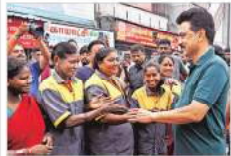
Tamil Nadu Chief Minister and DMK candidate for Kolathur constituency, MK Stalin, interacts with women workers during a voter outreach, in Tiruvannamalai on Wednesday.

West Bengal goes for polls in two phases on April 23 and 29. The poll panel deploys general, expenditure and police observers in poll-bound states to watch its eyes and ears. They report to the poll authority about different aspects from the ground to help it take corrective steps. —PTI