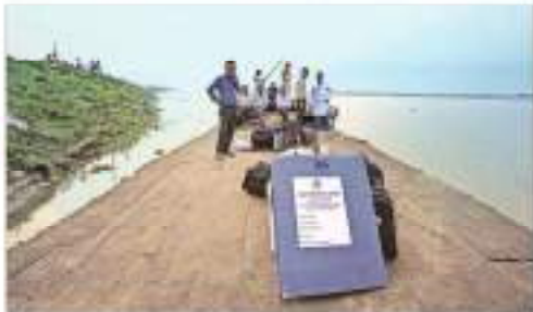
Polling officials board a boat to reach their respective booths, in Kamrup, Assam, on Wednesday.

Chief Minister Himanta Biswa Sarma has spearheaded the BJP's campaign across the state, with the party contesting